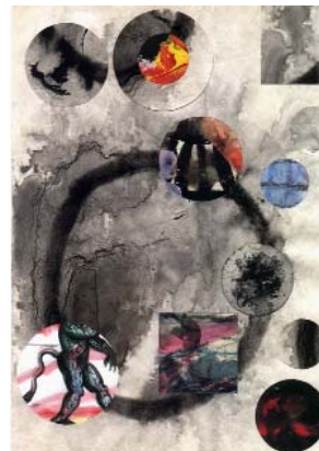
"For you", GW 2005