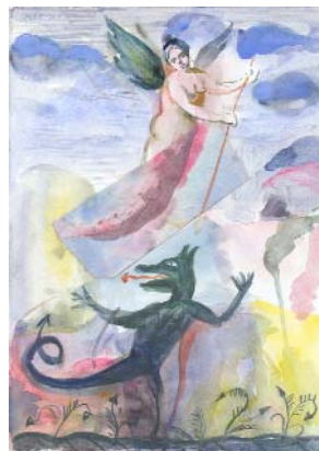
"Himmel und Hölle", AK 2000