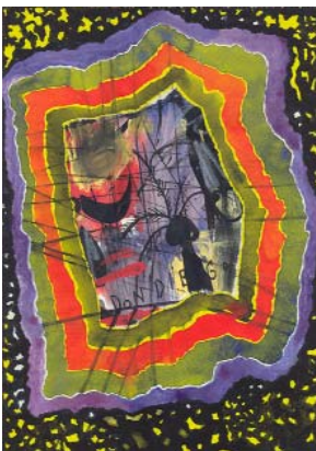
"Noche de Don Diego", GW 99