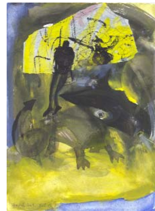
"In Berlin", AK 2002