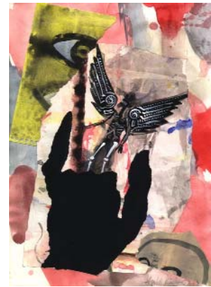
"Todesengel", AK 2003