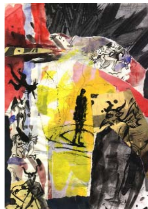
"Judecata celui tare", AK 2003