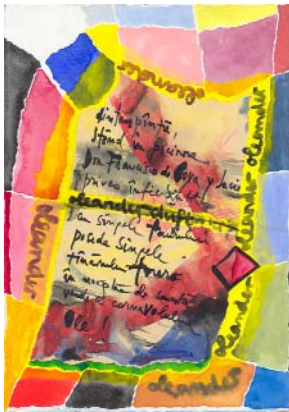
"Olé!anderduft", GW 1999