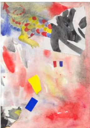
"Fremdes Tier", AK 2000