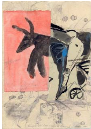
"Omogia lui Goya", AK 1999