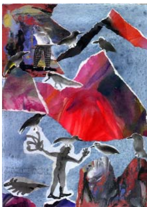
"Blinde Vogelfänger", GW 2003