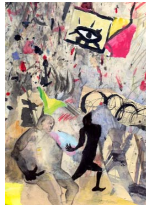
"Augenblick", GW 2002