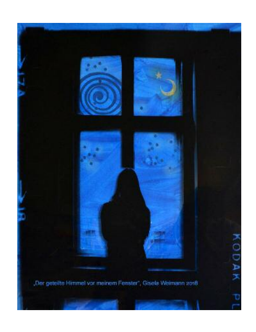
Image: "The divided sky in front of my window", negative film on watercolour and collage, 60 x 50 cm, 2018