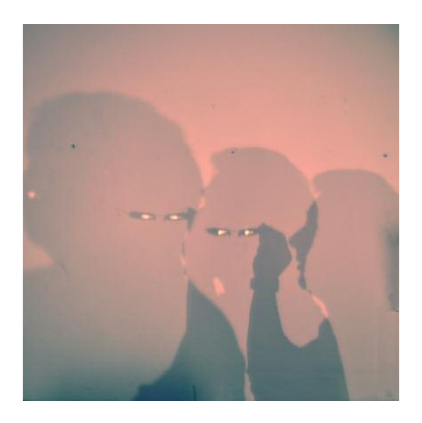
Image: "Ghost Günter in my studio", manipulated digital photo on fine art archival paper, 10 x 10 cm, 2018